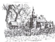
All Saints' Kingston Seymour