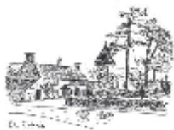
St John's Kenn